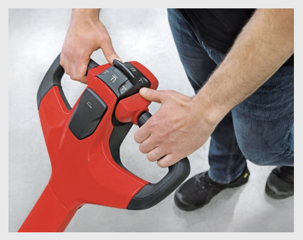
Ergonomic tiller head